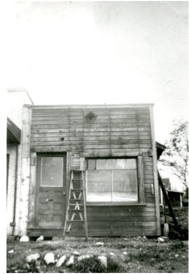
Trev's Store, 1942

Last year, the city of Coquitlam announced it had purchased both the Red House and Trev's properties. The MRA has been working closely with the City regarding potential development.