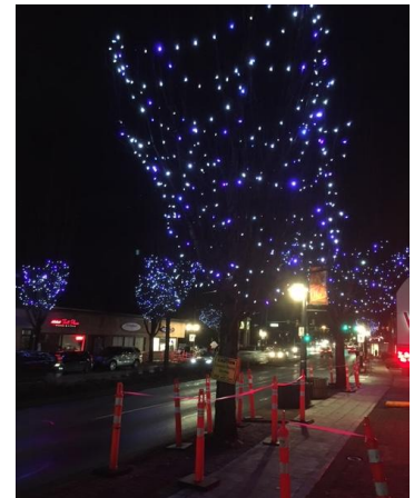
Brunette Street Lighting

There will be plenty of issues on which to collaborate in the coming year. Brunette Avenue revitalization continues. Hundreds of residential units have been proposed, along with a few interesting ideas around new amenities. Who knows? You might even be able to buy a cup of coffee on Brunette soon! We are also advocating for a redesign of the Brunette interchange. As we welcome hundreds of residents into Maillardville, this route will be critical for moving people and goods through the area, and for emergency vehicles travelling to and from Royal Columbian hospital. A municipal election is coming on October 15 th and we have a tremendous opportunity to call our local leaders' attention to the issues facing our community. Please pass this newsletter along to neighbours who are interested in playing a role.