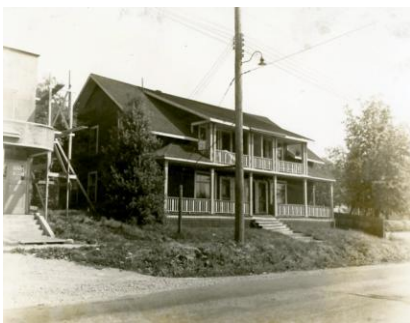
Red House - 1123 Brunette